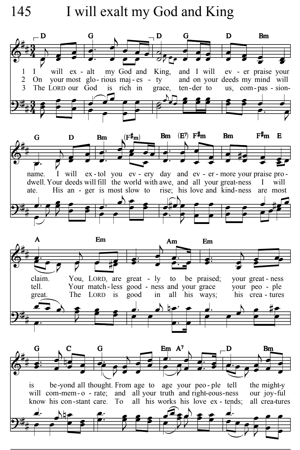
Text: Psalter Hymnal , 1987 Tune: C. Hubert H. Parry, 1916; arr. Sing to the Lord , 2012